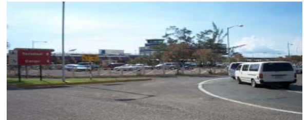
AIRPORTS AUTHORITY OF JAMAICA