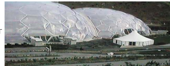
THE EDEN PROJECT